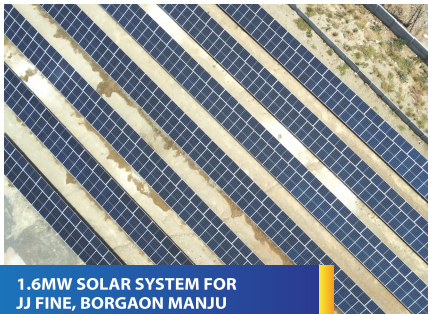
1.6MW SOLAR SYSTEM FOR JJ FINE, BORGAON MANJU