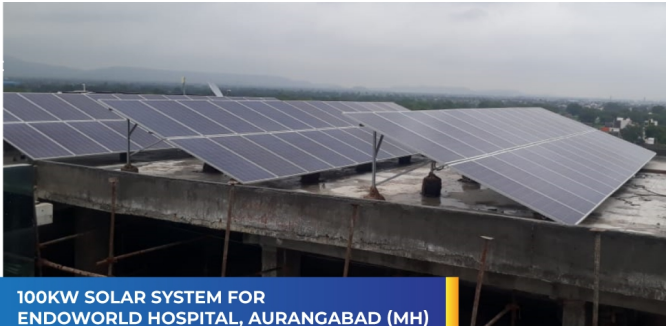
100KW SOLAR SYSTEM FOR ENDOWORLD HOSPITAL, AURANGABAD (MH)