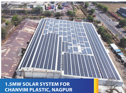
1.5MW SOLAR SYSTEM FOR CHANVIM PLASTIC, NAGPUR