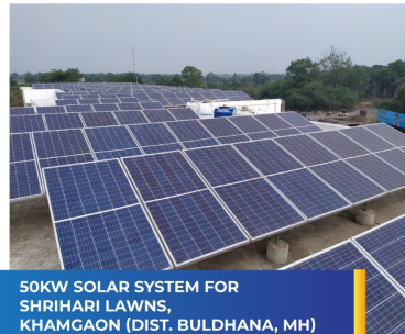
50KW SOLAR SYSTEM FOR SHRIHARI LAWNS, KHAMGAON (DIST. BULDHANA, MH)