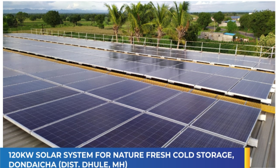
120KW SOLAR SYSTEM FOR NATURE FRESH COLD STORAGE, DONDAICHA (DIST. DHULE, MH)