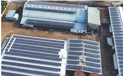
630KW SOLAR SYSTEM FOR ANAND MOHATA, NAGPUR