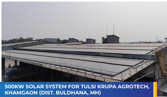
500KW SOLAR SYSTEM FOR TULSI KRUPA AGROTECH, KHAMGAON (DIST. BULDHANA, MH)