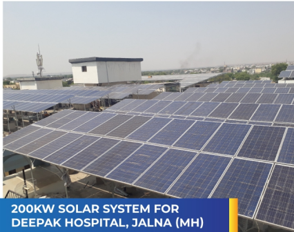
200KW SOLAR SYSTEM FOR DEEPAK HOSPITAL, JALNA (MH)