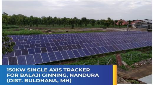
150KW SINGLE AXIS TRACKER FOR BALAJI GINNING, NANDURA (DIST. BULDHANA, MH)