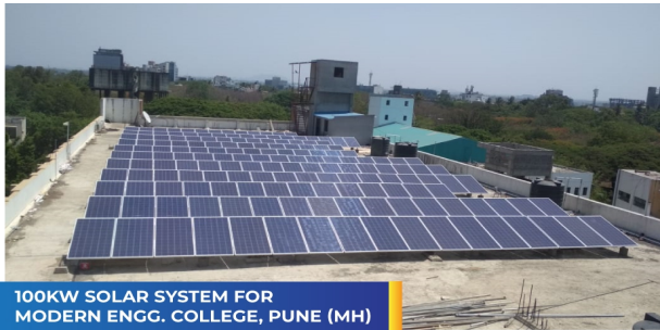
100KW SOLAR SYSTEM FOR MODERN ENGG. COLLEGE, PUNE (MH)