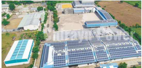
1.1MW SOLAR SYSTEM FOR LEELOTTAM INDUSTRIES, KHAMGAON