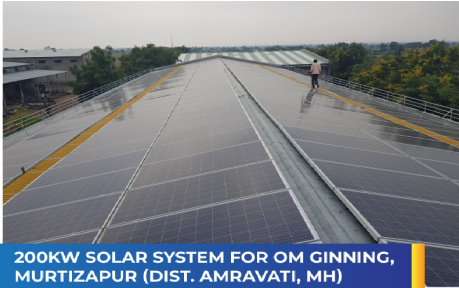
200KW SOLAR SYSTEM FOR OM GINNING, MURTIZAPUR (DIST. AMRAVATI, MH)