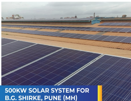
500KW SOLAR SYSTEM FOR B.G. SHIRKE, PUNE (MH)