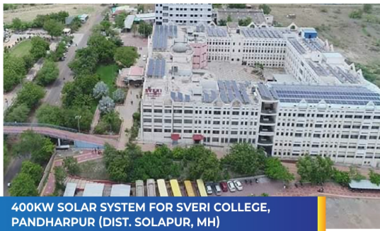
400KW SOLAR SYSTEM FOR SVERI COLLEGE, PANDHARPUR (DIST. SOLAPUR, MH)