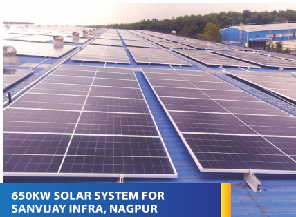
650KW SOLAR SYSTEM FOR SANVIJAY INFRA, NAGPUR