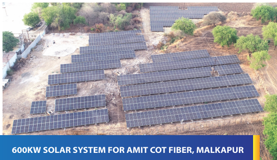
600KW SOLAR SYSTEM FOR AMIT COT FIBER, MALKAPUR