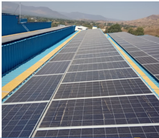
116KW SOLAR SYSTEM FOR P.D. SHAH COLD STORAGE, WAI (DIST. SATARA, MH)