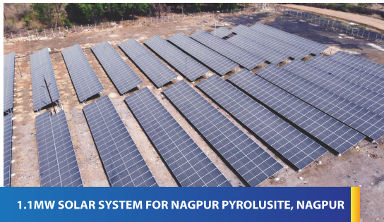
1.1MW SOLAR SYSTEM FOR NAGPUR PYROLUSITE, NAGPUR