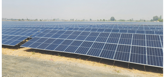
5MW SOLAR SYSTEM FOR SOLAR EXPLOSIVES ,NAGPUR